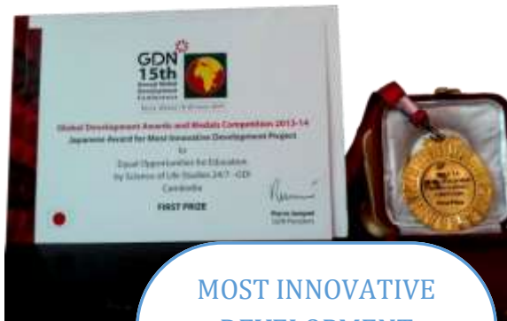
MOST INNOVATIVE DEVELOPMENT PROJECT 2013-2014