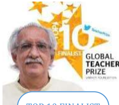
TOP 10 FINALIST