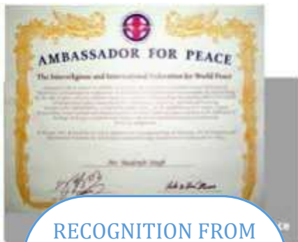
RECOGNITION FROM THE AMBASSADOR OF PEACE