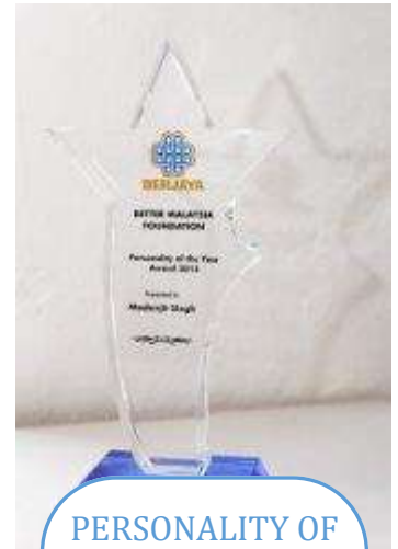
PERSONALITY OF THE YEAR 2012