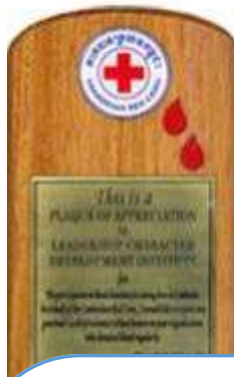
CAMBODIAN RED CROSS PLAQUE OF APPRECIATION