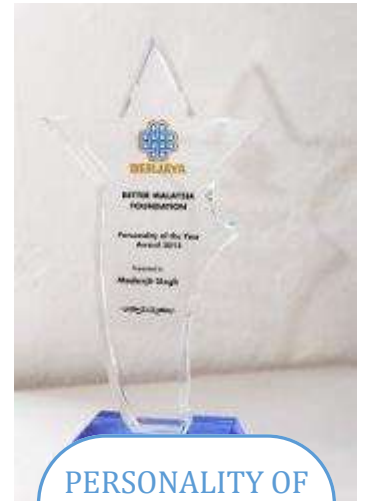
PERSONALITY OF THE YEAR 2012